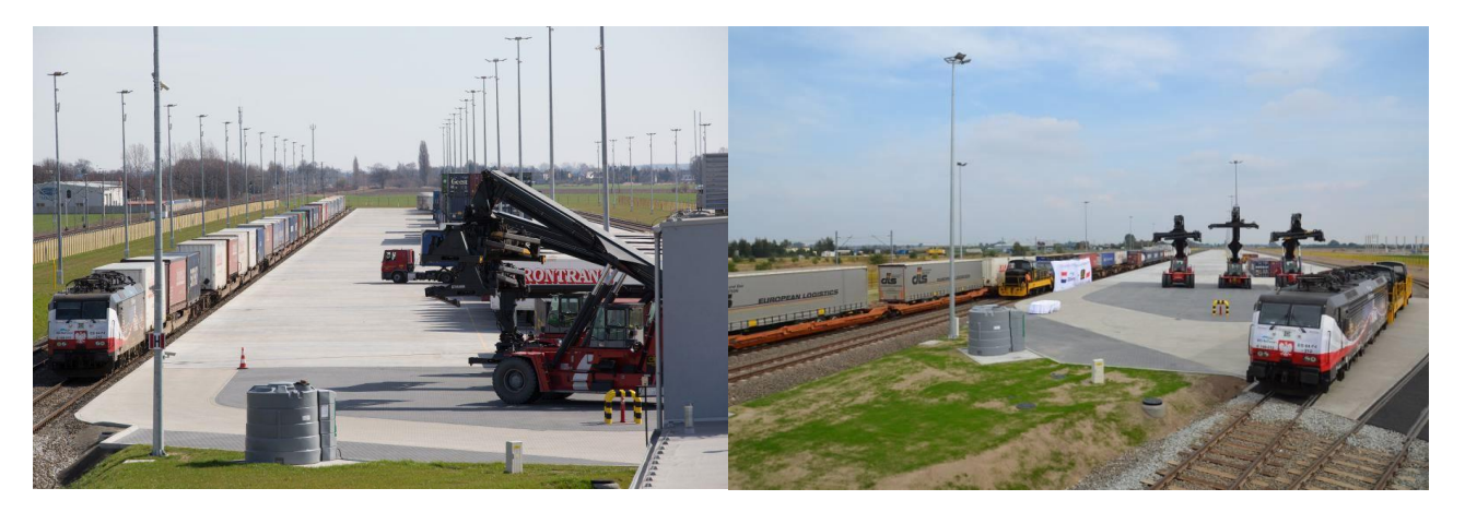
Figure 8 – CLIP – container terminal