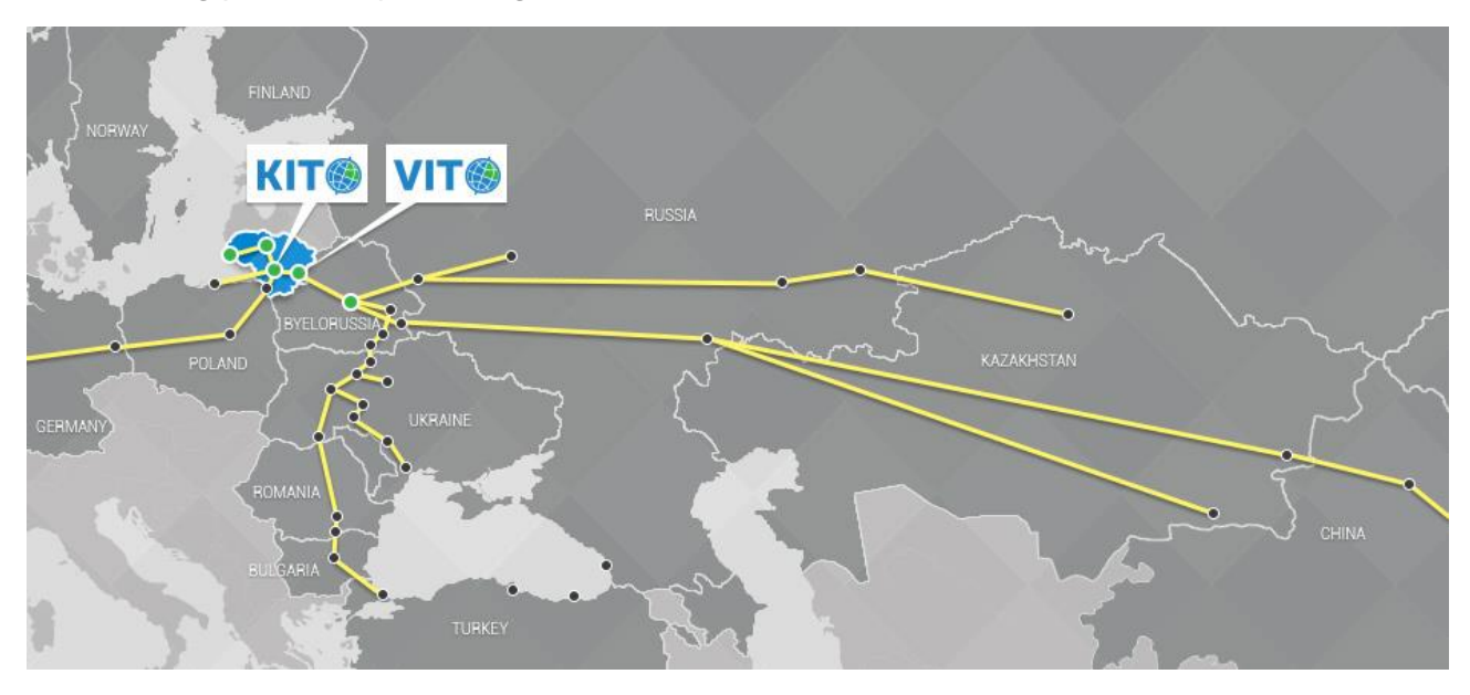
Figure 14 – Kaunas and Vilnius International Terminal container trains connections

The following pictures is presenting container trains connections of both Lithuanian terminals.