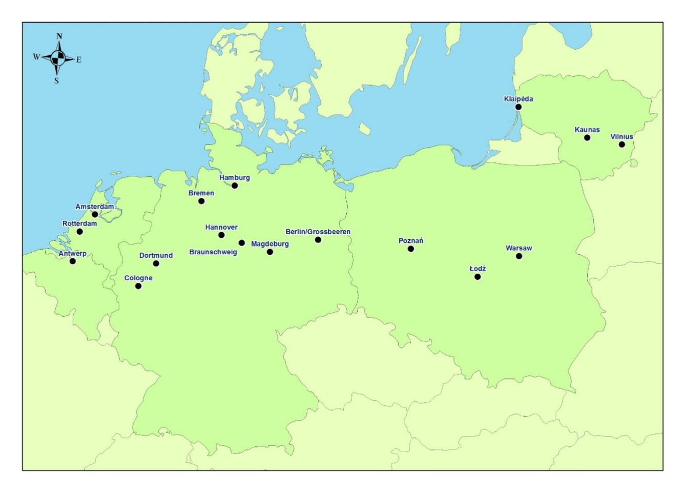
Figure 1 – North Sea Baltic core network rail road terminals

The North Sea-Baltic Corridor consists of 5947 km of railways, 4029 km of roads, and 2186 km of inland waterways and connects the ports of the eastern shore of the Baltic Sea with ports of the North Sea, situated in Northern Germany, Belgium and the Netherlands. The Corridor connects the capitals of all eight countries concerned namely: Helsinki, Tallinn, Riga, Vilnius, Warsaw, Berlin, Brussels and Amsterdam. The North Sea – Baltic Corridor has 17 core network rail road terminals.