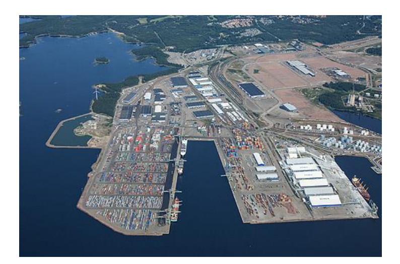
Figure 16 – Mussalo Container Terminal-Kotka