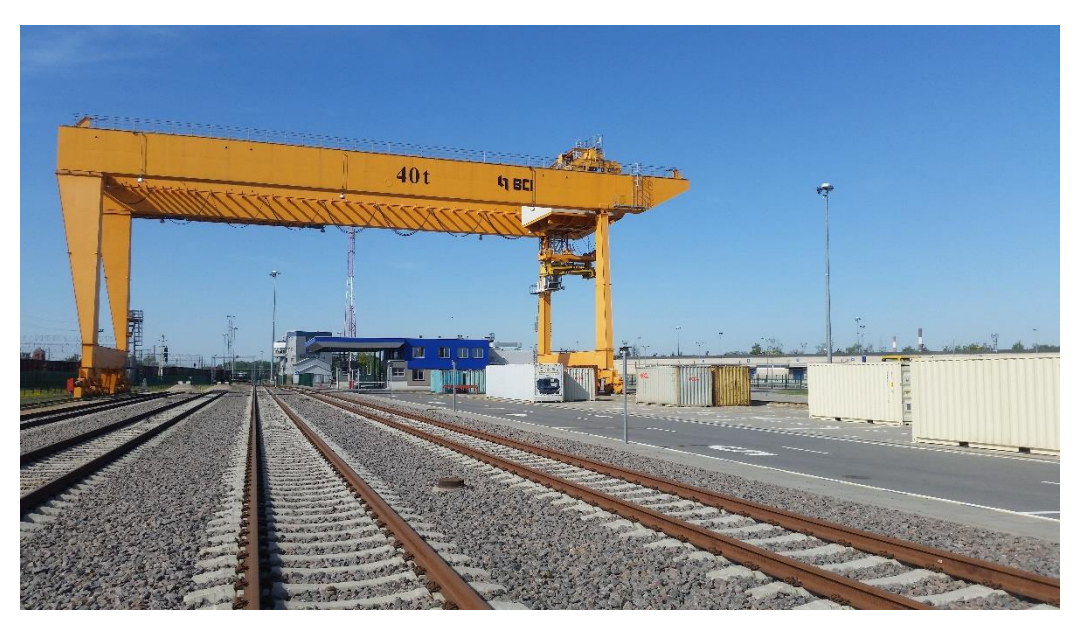
Figure 13 – Kaunas Intermodal Terminal