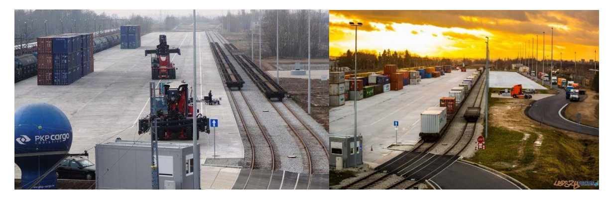
Figure 10 – Poznań Franowo – container terminal