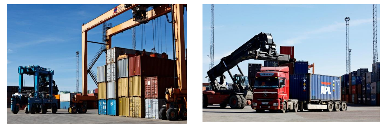
Figure 15 – Transiidikeskuse AS – container terminal