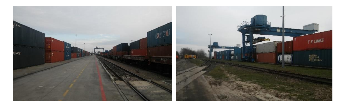
Figure 9 – Małaszewicze – container terminal